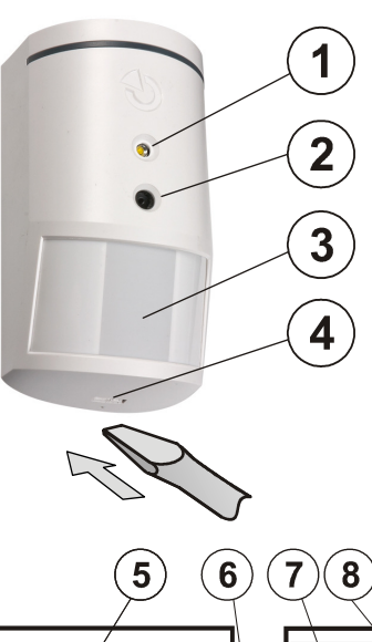
Figure: 1 – flash for illumination; 2 – camera lens; 3 – PIR detector lens; 4 – cover tab;

The detector can be installed onto a wall or in the corner of a room. There should be no obstacles which quickly change temperature (electric heaters, gas appliances, etc.) or which move (e.g. curtains hanging above a radiator) or pets in the detector's field of sight. It is not recommended to install the detector opposite to windows or floodlights or in places with over-intense air circulation (close to ventilators, heat sources, air conditioning outlets, unsealed doors, etc.). There should be no obstacles in front of the detector which might obstruct its view.